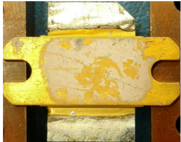
FIGURE 2: Example of a transistor that failed due to incorrect application of silicone grease.